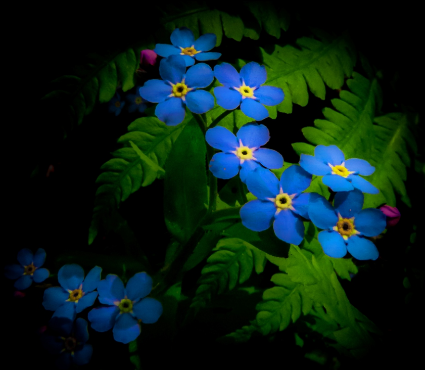
Ferns and some Forget-me-nots