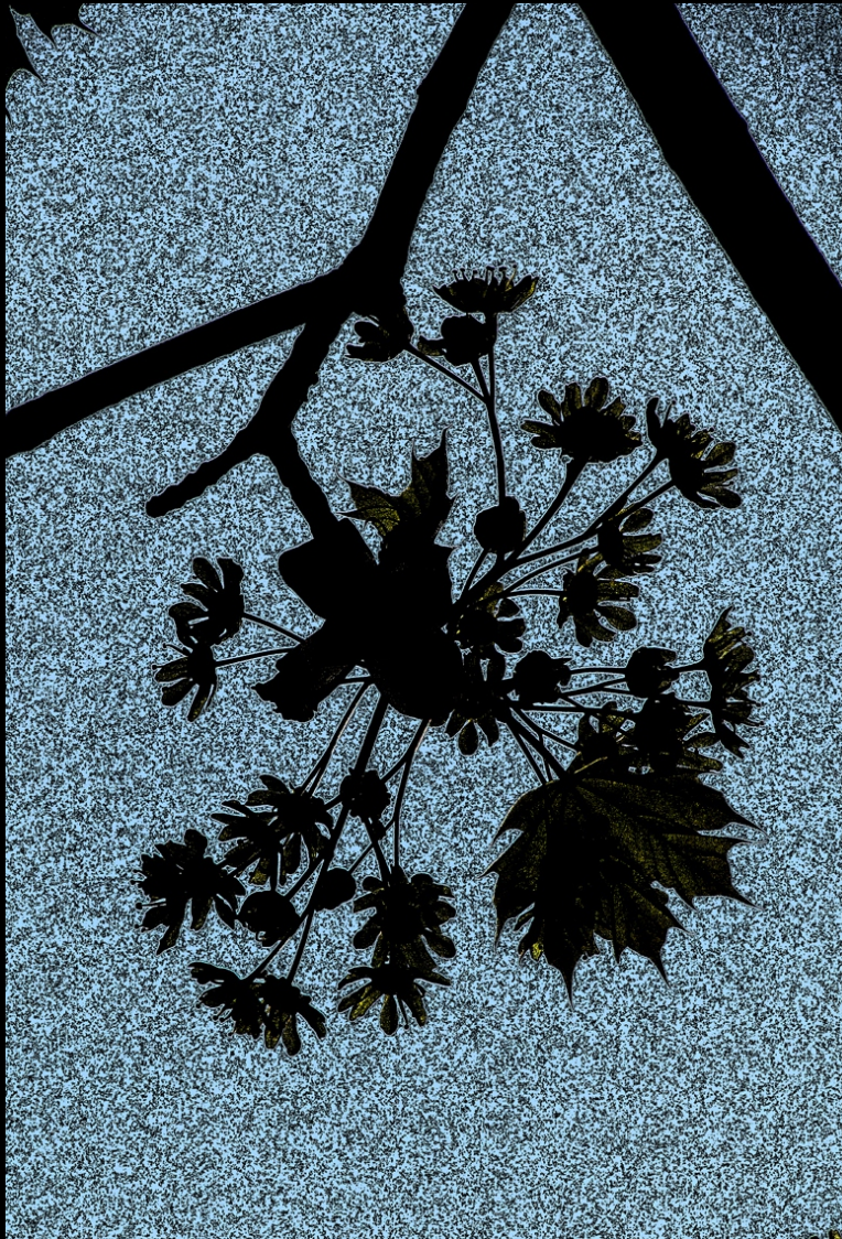
Tree Leaves sprouting in spring against a bright cloudy sky