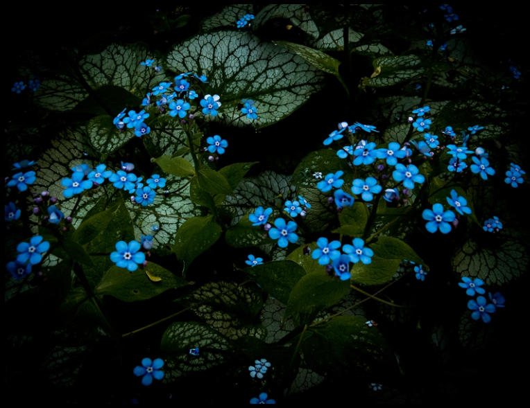
Brunnera macrophylla 'Looking Glass' Buglos