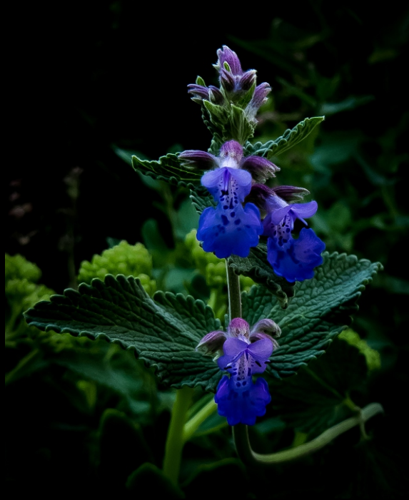
Lovely textured leaves