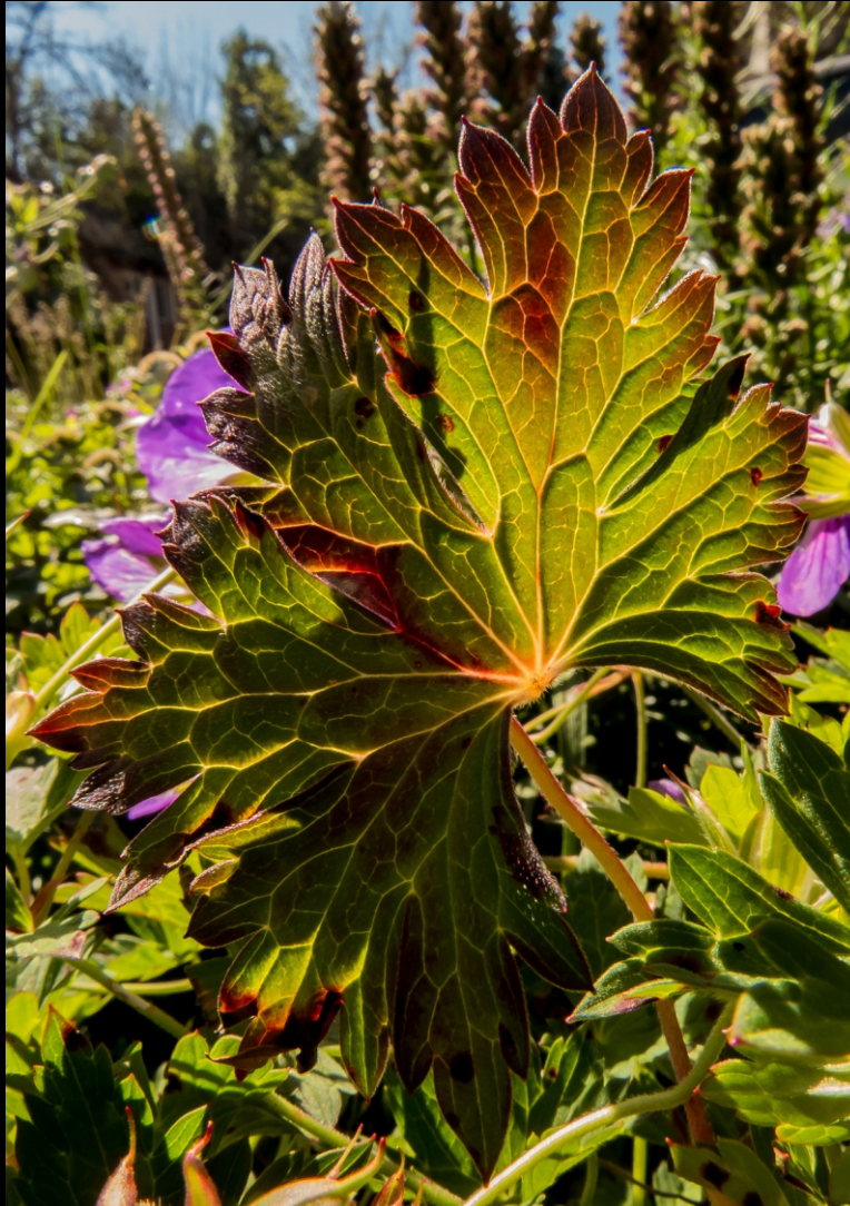
Shadows, shapes, shades & textures