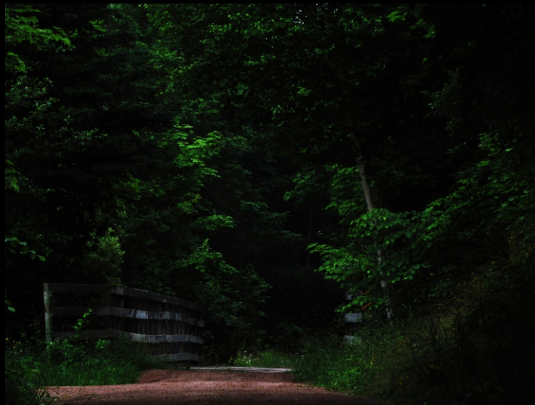
Maple leaves (with a fence and a small wooden bridge)