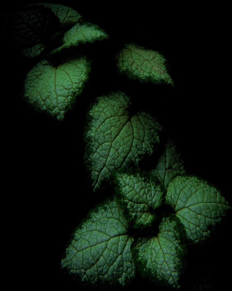
Varigated Siberian Buglos ( Brunnera macrophylla )'