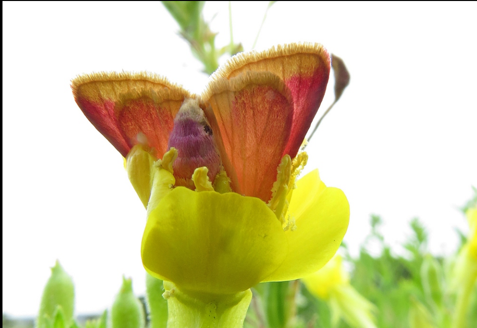
Ruby Tiger Moth ( Phragmatobia fuliginosa )