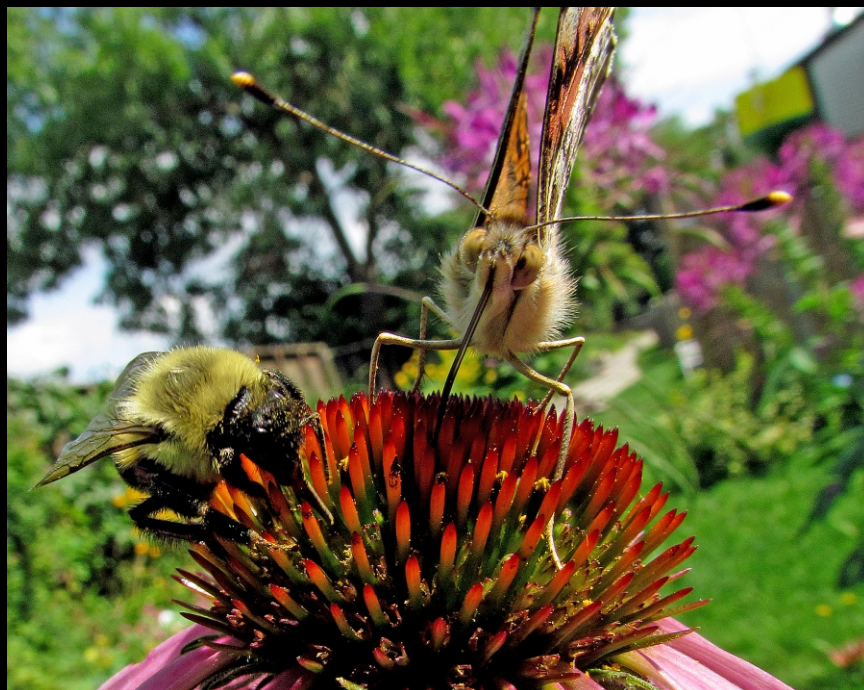
Bumble Bee ( Bombus ) & Painted Lady ( Vanessa atalanta ) on a Coneflower ( Echinacea )