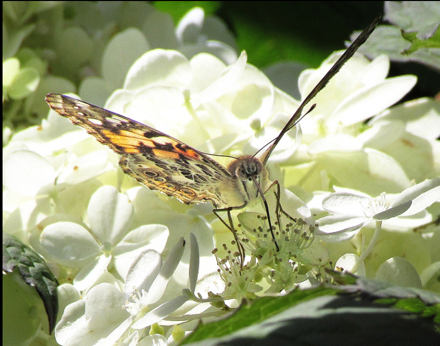
Painted Lady on Hydrangia ( Vanessa atalanta )