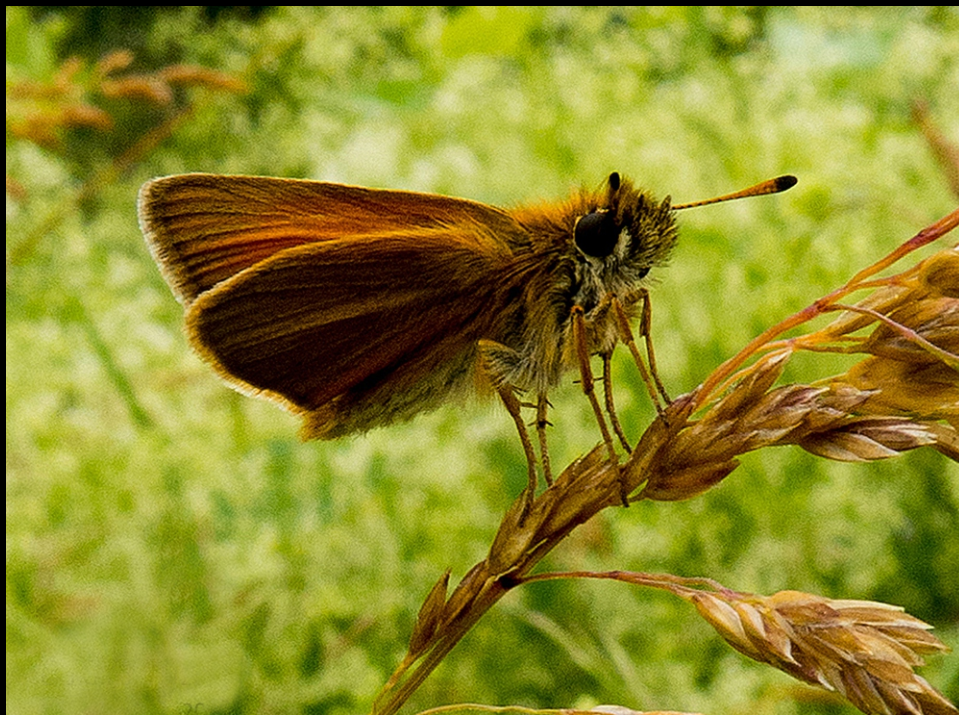
European Skipper Butterfly ( thymelicus lineola )