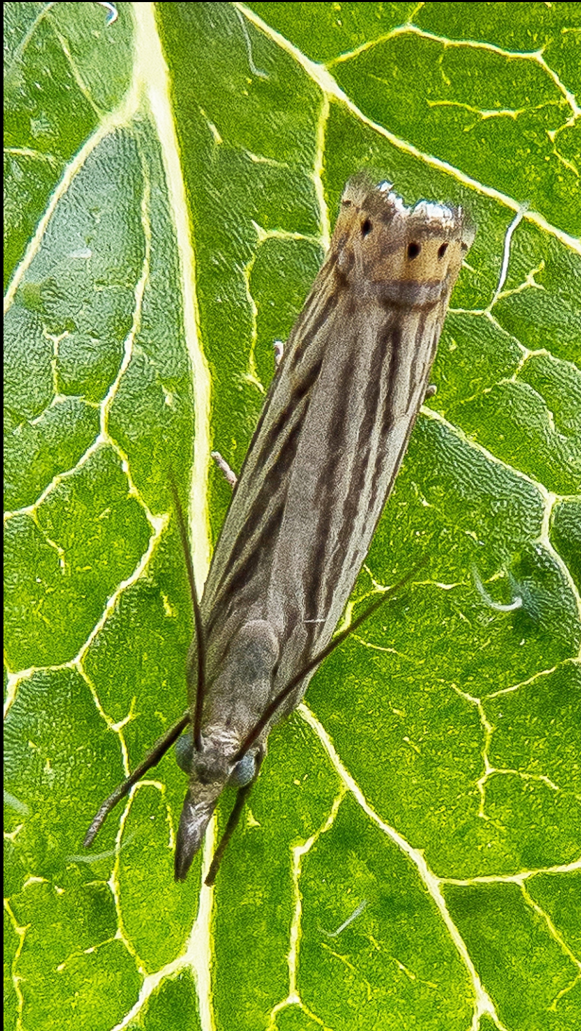
Moth Garden Grass-veneer ( Chrysoteuchia culmella )