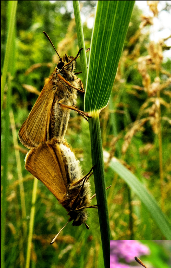
European Skipper ( thymelicus lineola ) Britannia Meadow