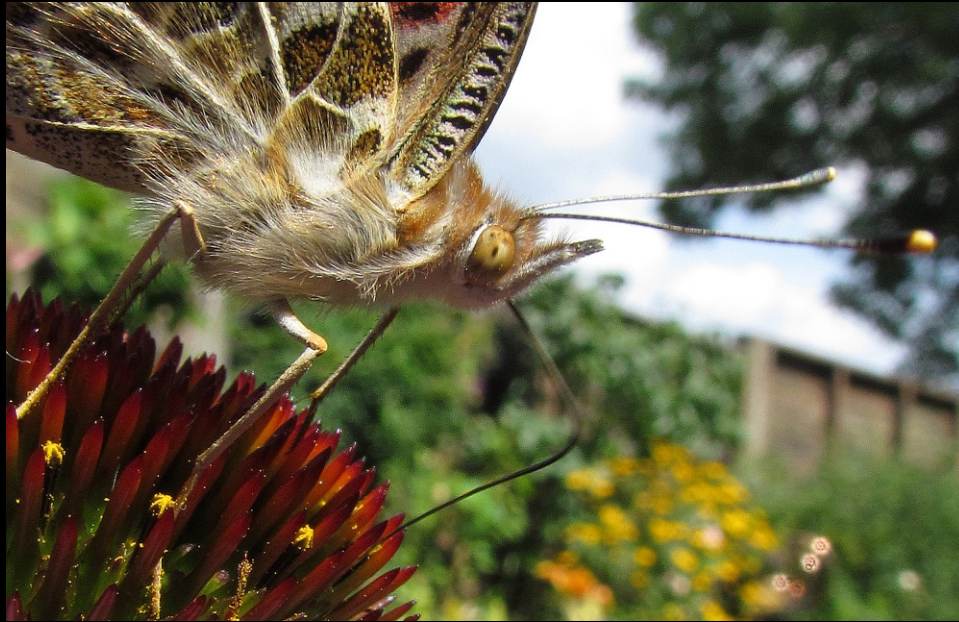
Painted Lady Butterfly ( Chauliognatha pennsylvanicus )