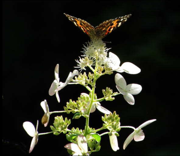
On the Cover Painted Lady Butterfly ( Phymata sp. ) hovering over a Hydrangia

(According to English folklore, the name 'Butterfly' arose from "Flutterby", an early designation that, quite accurately, described its flight pattern.)