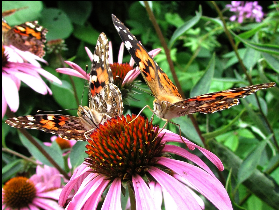
Painted Lady Butterflies ( Vanessa kershawi ) on a Coneflower ( Echinacea )