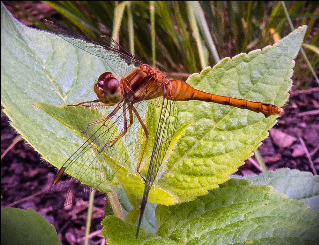
White-faced Meadowhawk Dragonfly ( Sympetrum obtrusum )