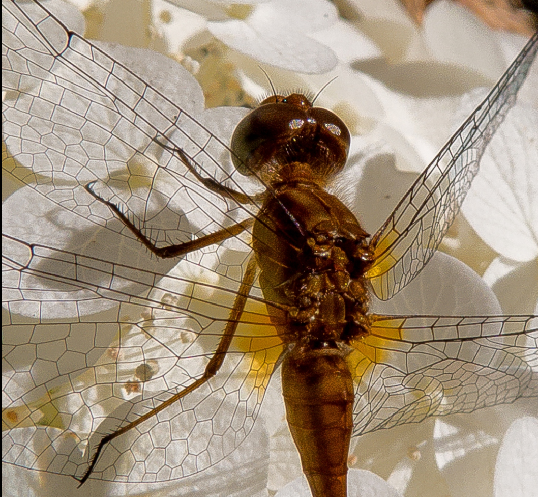
Dragonfly ( anisoptera )