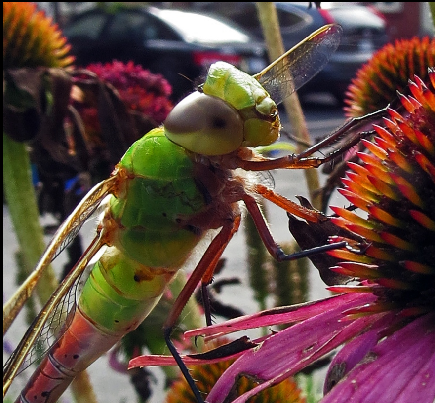
Green Darner Dragonfly ( anax junius )