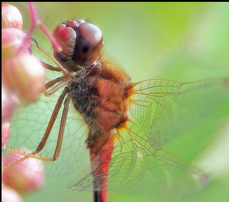
Dragonfly ( Aeshna grandis )