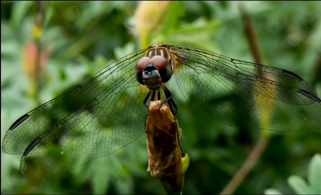
Blue Nose Dragonfly ( Platycephala eliseva )