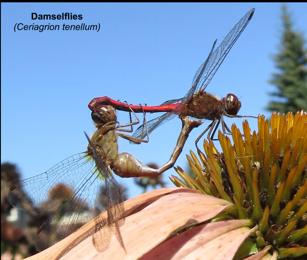
Damselflies ( Ceriagrion tenellum )