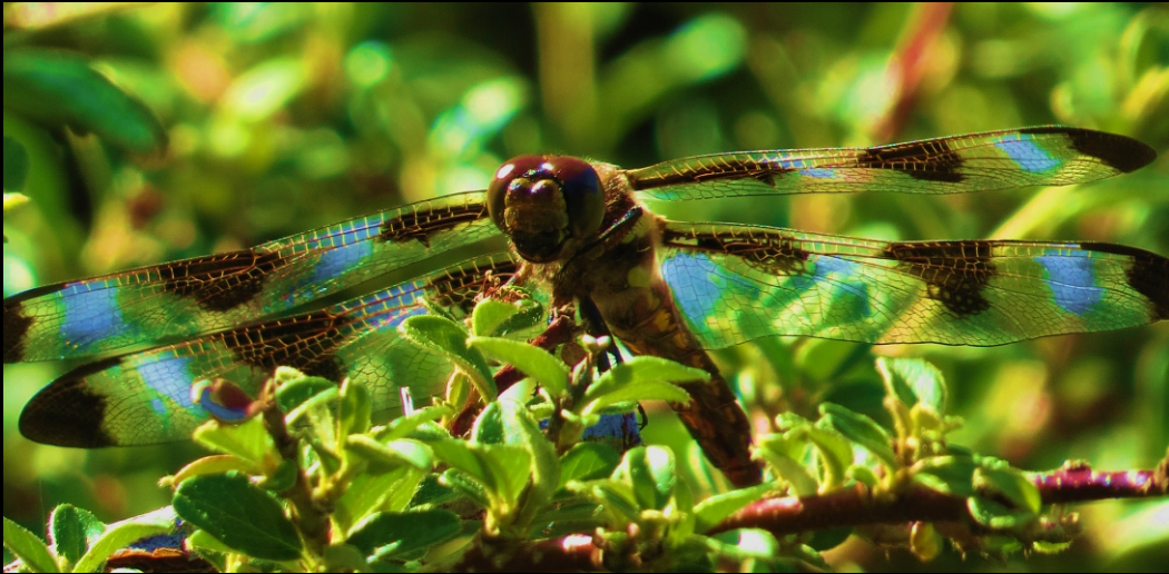
Twelve-spotted Skimmer Dragonfly ( libellula pulchella )