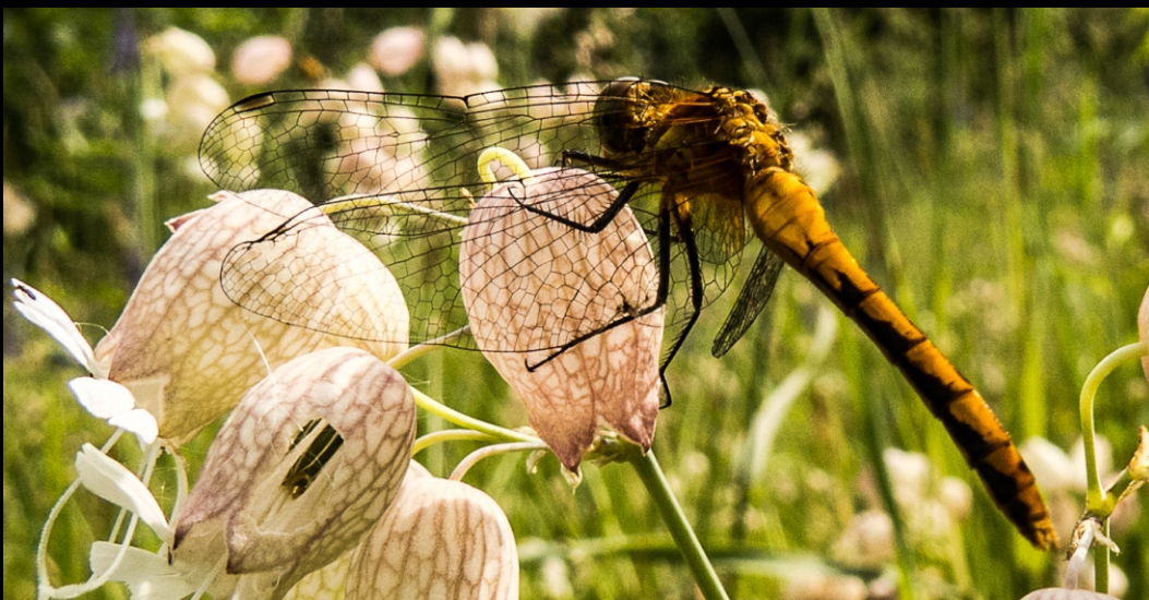
White-faced Meadowhawk Dragonfly ( Sympetrum obtrusum )