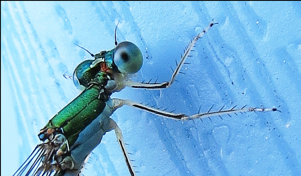
Damselfly ( Lestes viridis )