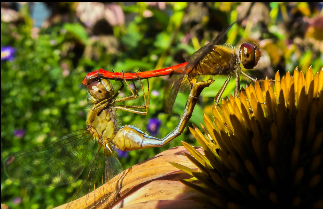
Damselflies ( Ceriagrion tenellum )