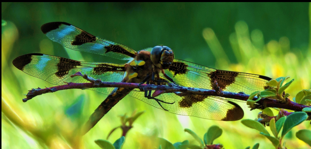
Twelve-spotted Skimmer Dragonfly ( libellula pulchella )