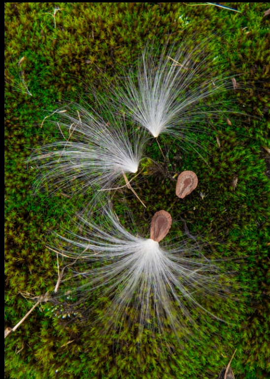
Milkweed seeds ( Asclepias syriaca )