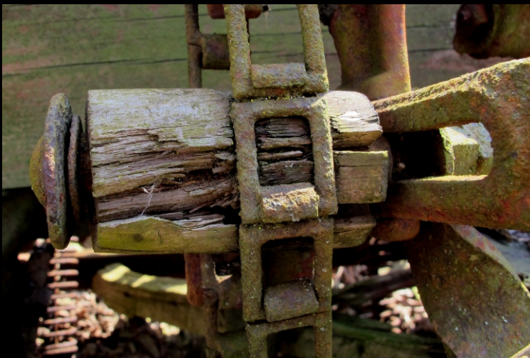
Machinery from a bygone era.