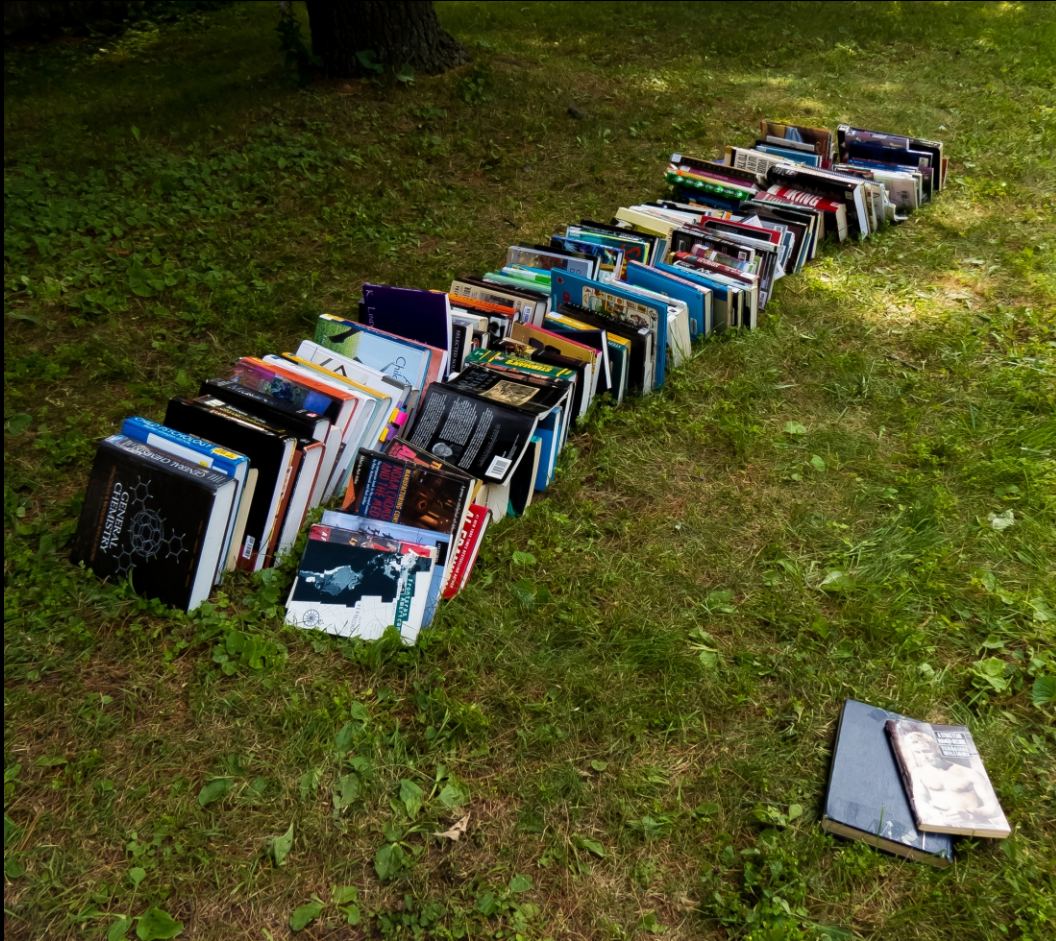
Books for the taking - displayed on a neighbour's front lawn.