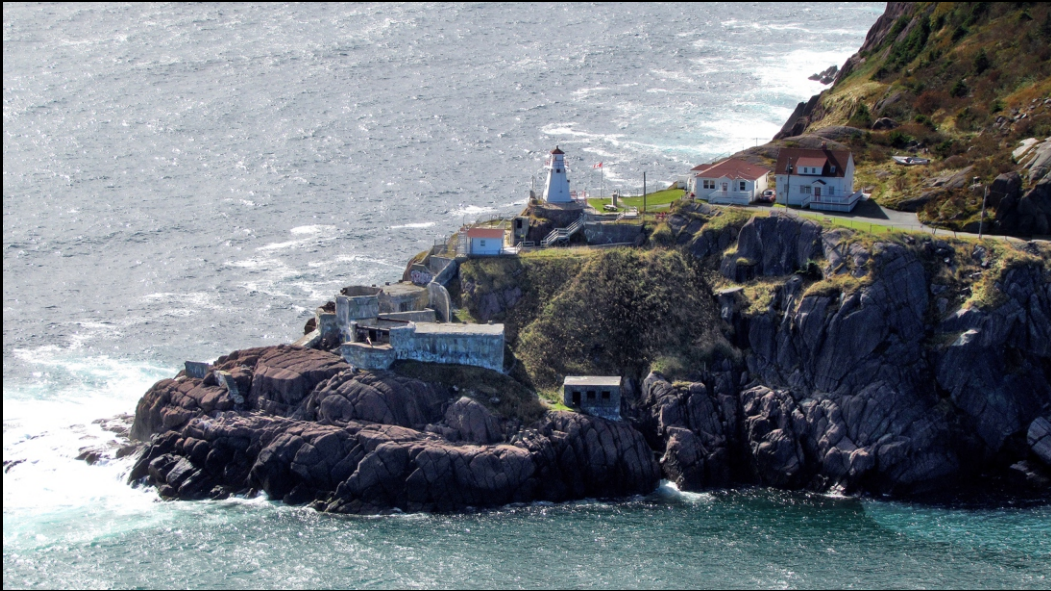
Fort Amherst , at the entrance to St. John's Harbour, was built during WW II to defend against German U-boats. Two 4.7-inch B Mark IV guns remain in place. I took this shot in 1972.