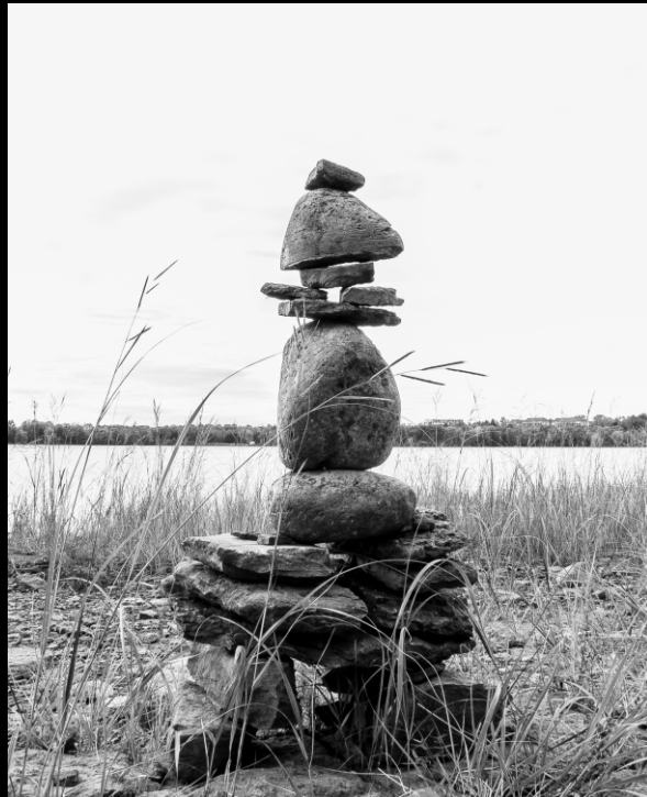
Stone Stack South Shore Ottawa River