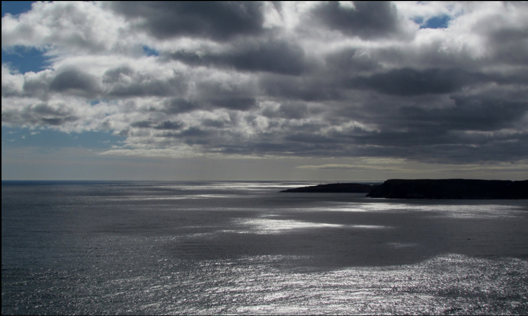
The Atlantic Ocean from Signal Hill, St. John's NF, 1975. This is looking approximately south with the Cape Spear Lighthouse (barely visible) in the middle.

Below, Cape Spear early one morning in 1968.