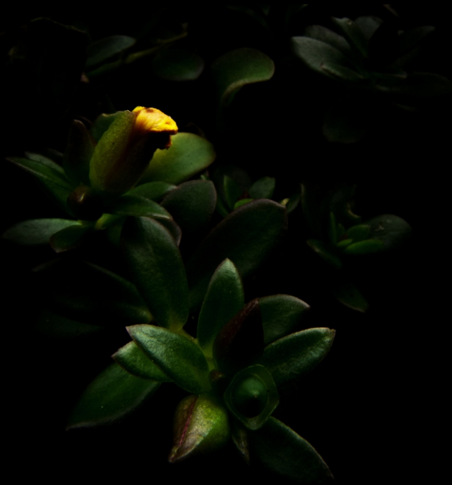
Portulaca ( oleracea )