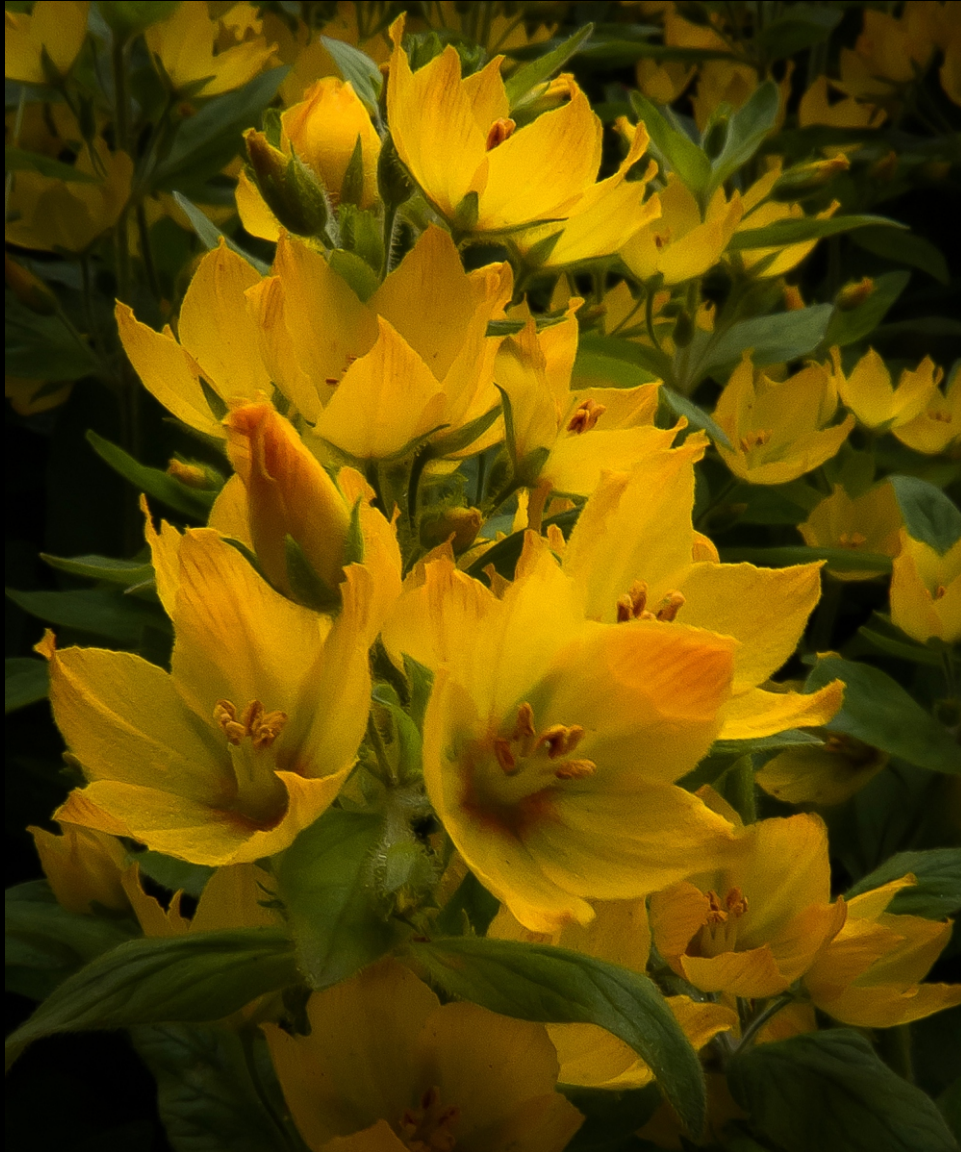
Behind Gerry and Debbie's cottage