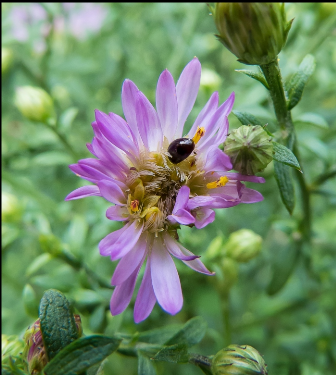
Black Lady Beetle ( Stethorus punctum ) on a Santa Barbara Daisy ( Erigeron karvinskianus )