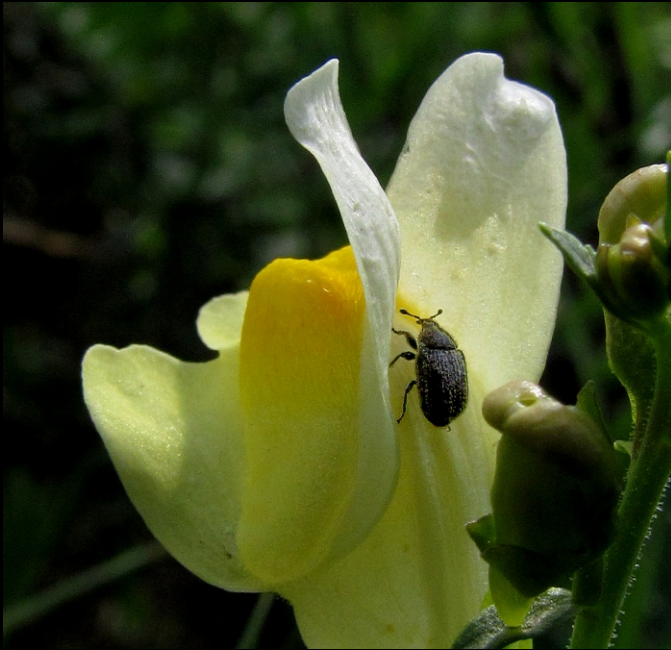
Beetle foraging on Butter and Eggs