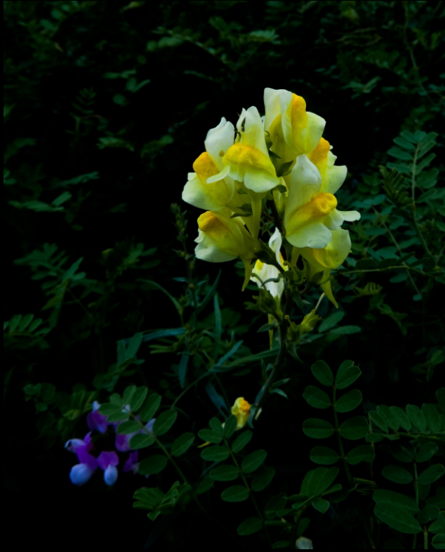
Butter & Eggs ( Linaria vulgaris )