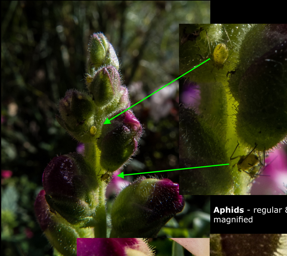
Aphids - regular & magnified