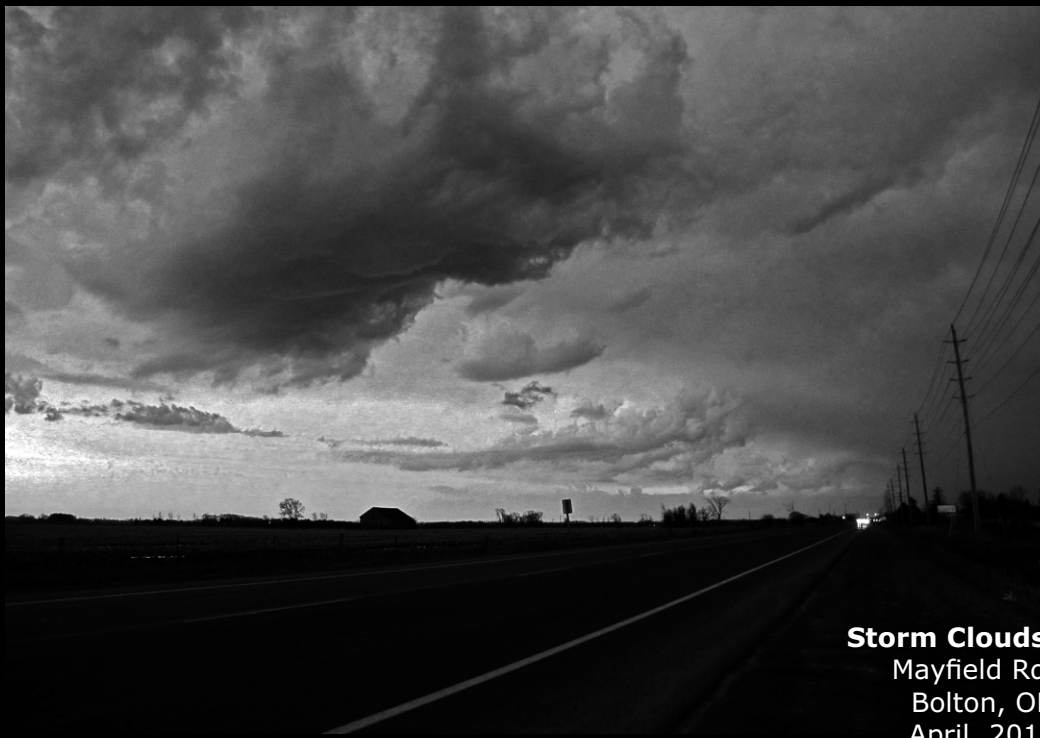
Storm Clouds, Mayfield Rd, Bolton, ON April, 2012