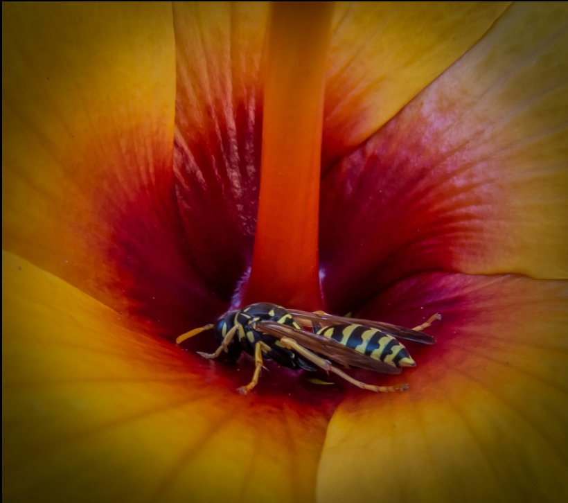
Hibiscus with Yellowjacket Wasp ( Vespula pennsylvanica )