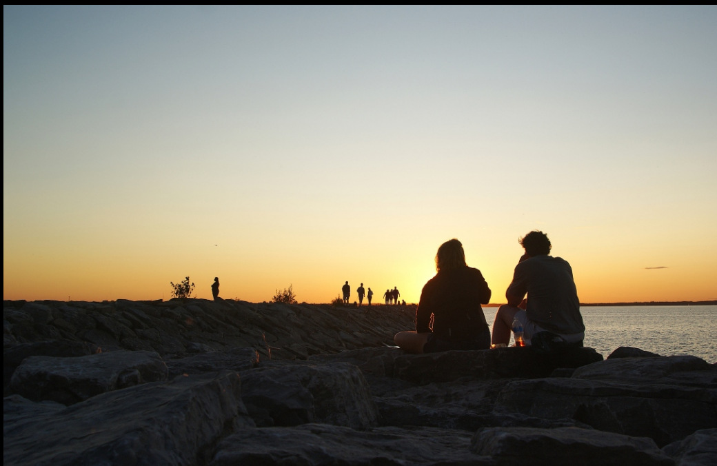
Sunset at Britannia Beach in Ottawa's west end