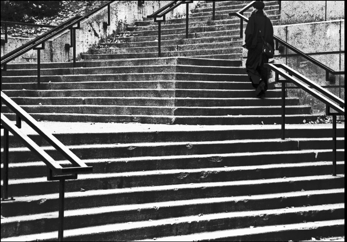
Pedestrian underpass downtown Ottawa