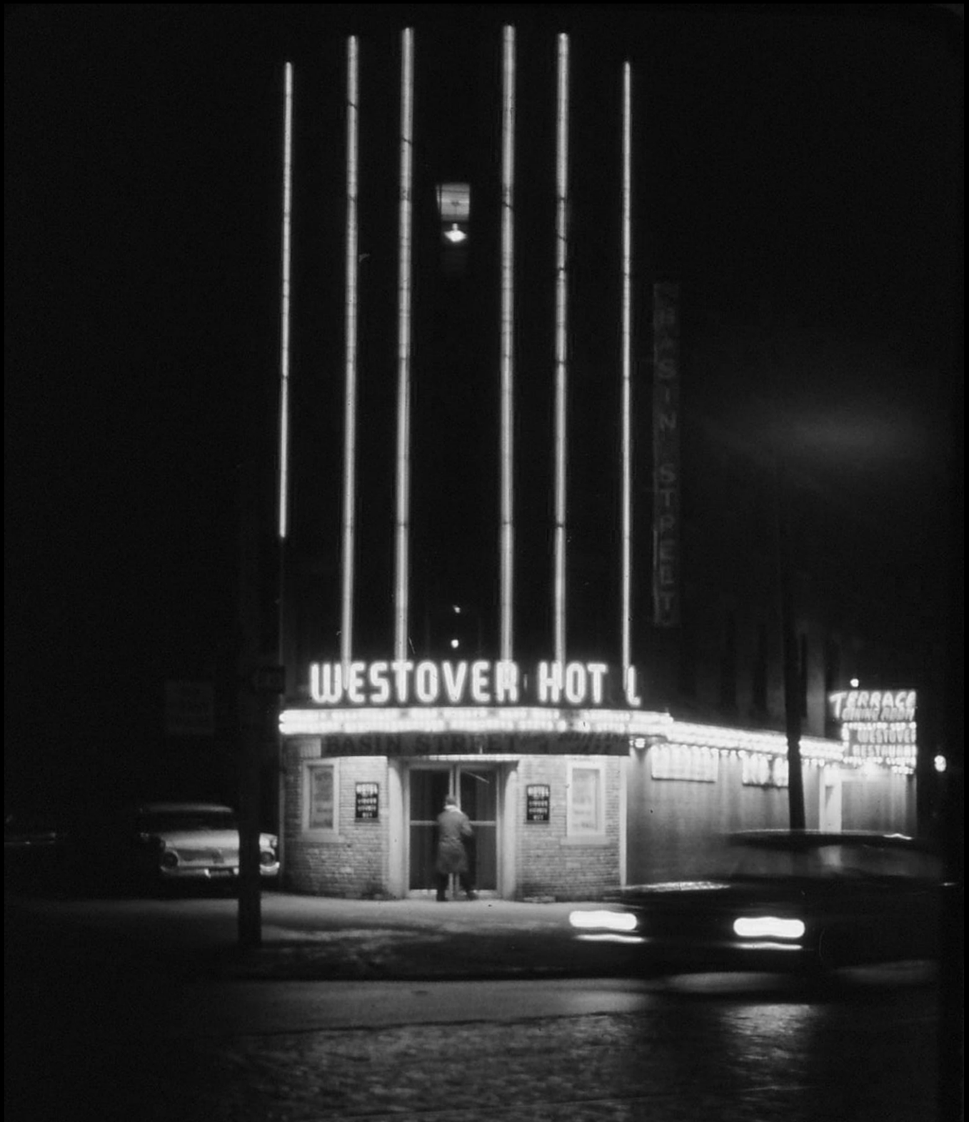
Jarvis Street, Toronto, 1958