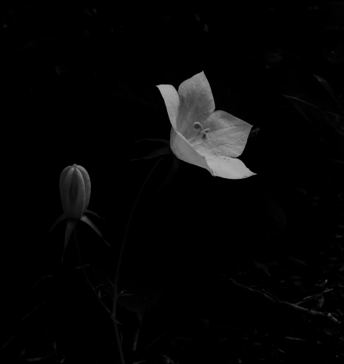
Bud and Blossom