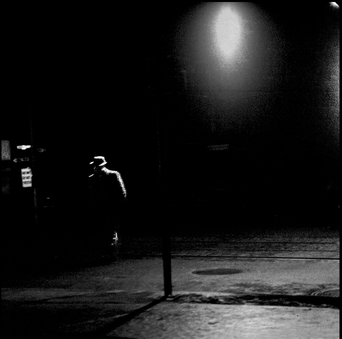
Jarvis Street, Toronto, 1959