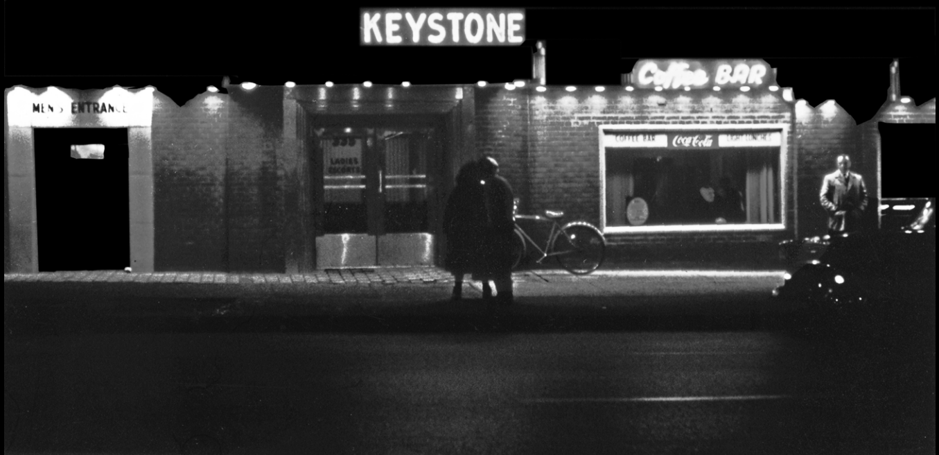
The Keystone, Jarvis Street, Toronto, Ontario, 1958