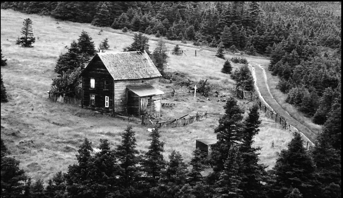
Abandoned, Nova Scotia