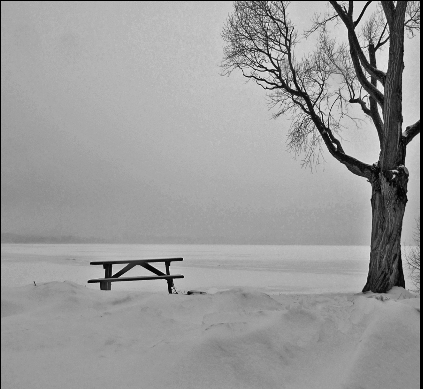
Ottawa River in January