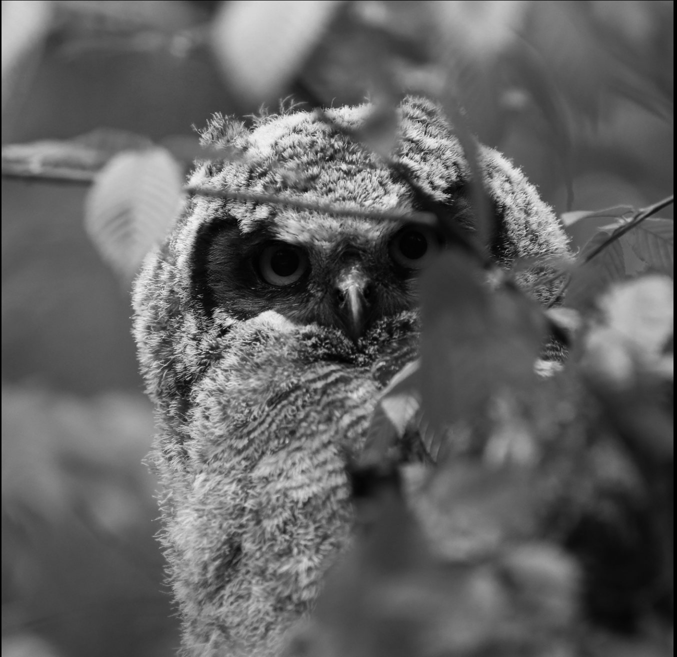
We were meandering along a path in a local forest and happened across a nest of owls.