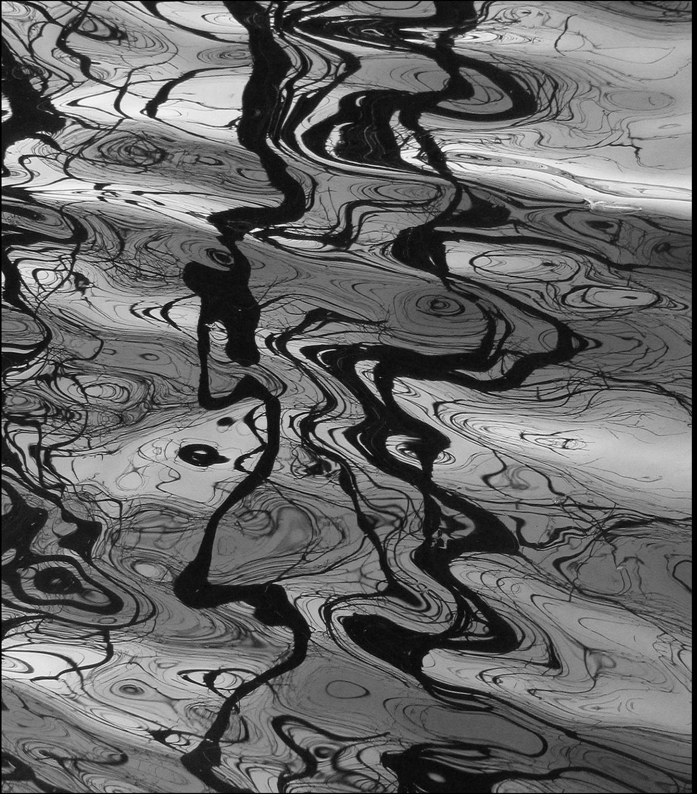
Ottawa River in summer