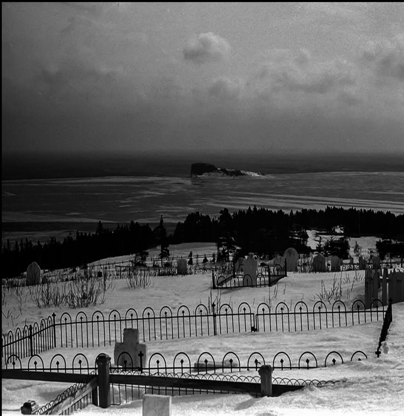
Conception Bay, Newfoundland