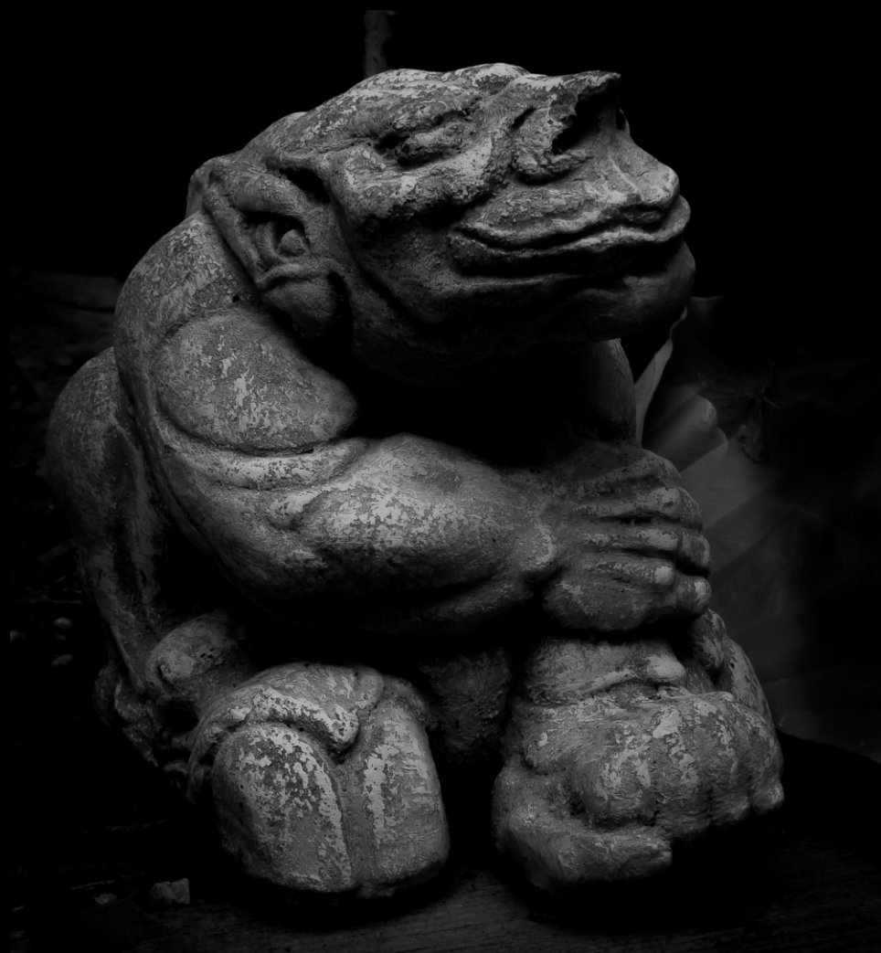
Gargoyle in a neighbor's back yard