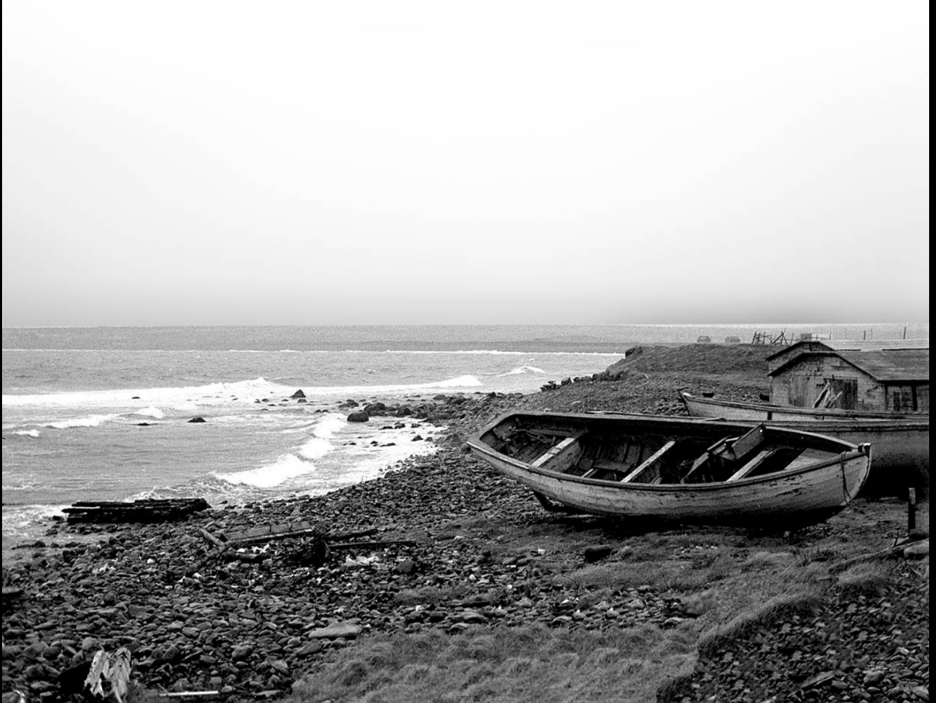
South Coast of Newfoundland