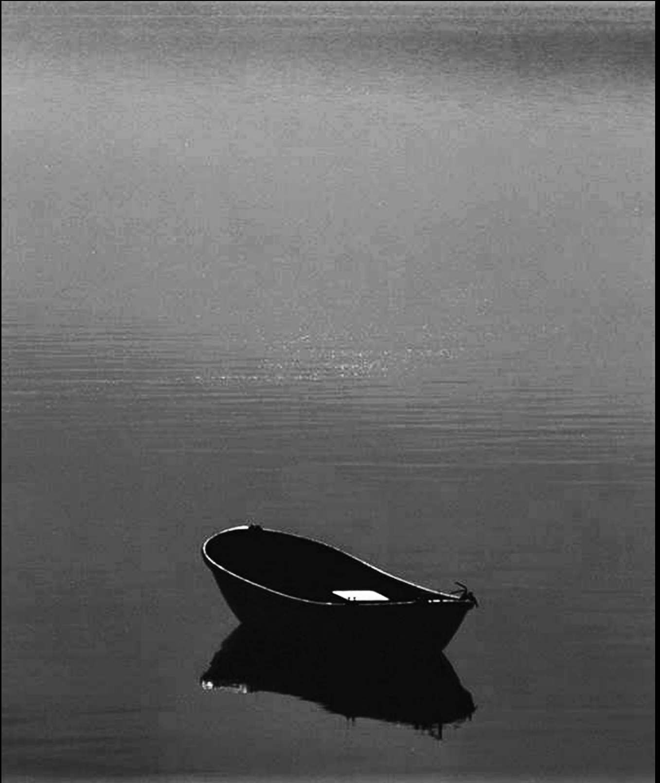
Conception Bay, Newfoundland