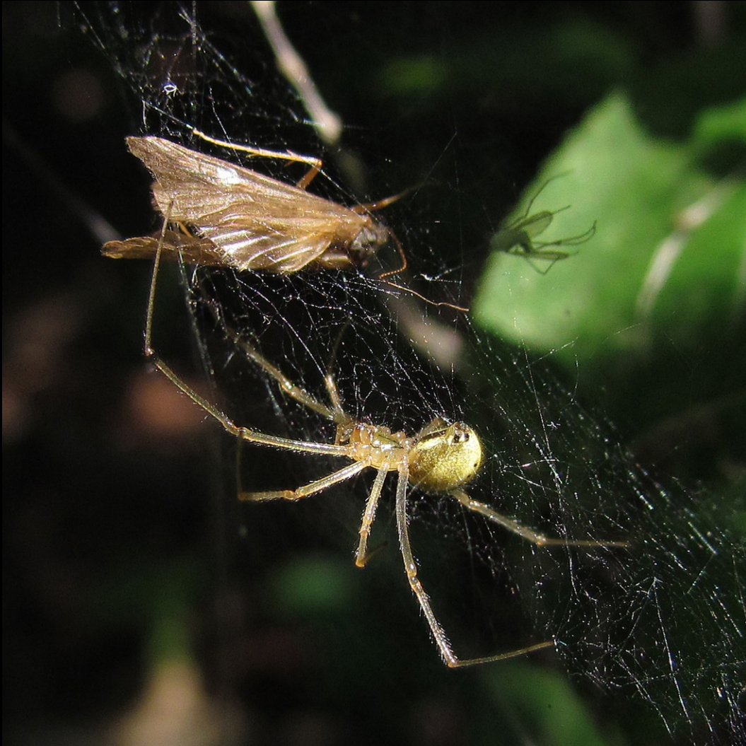
Yellow-legged sac spider ( Cheiracanthium inclusum ) (Maybe) (Dinner unidentified) In Britannia Woods, Ottawa