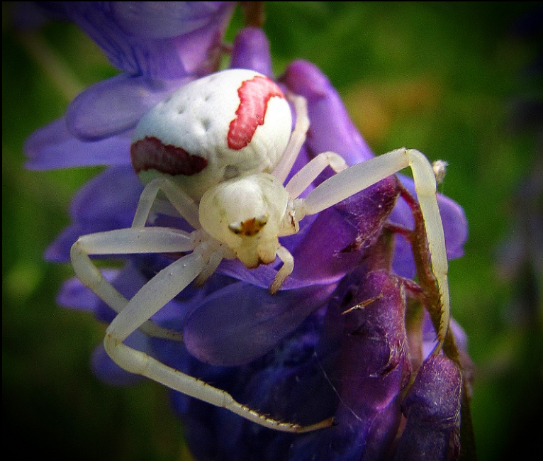
Goldenrod Crab Female ( Misumena vatia )