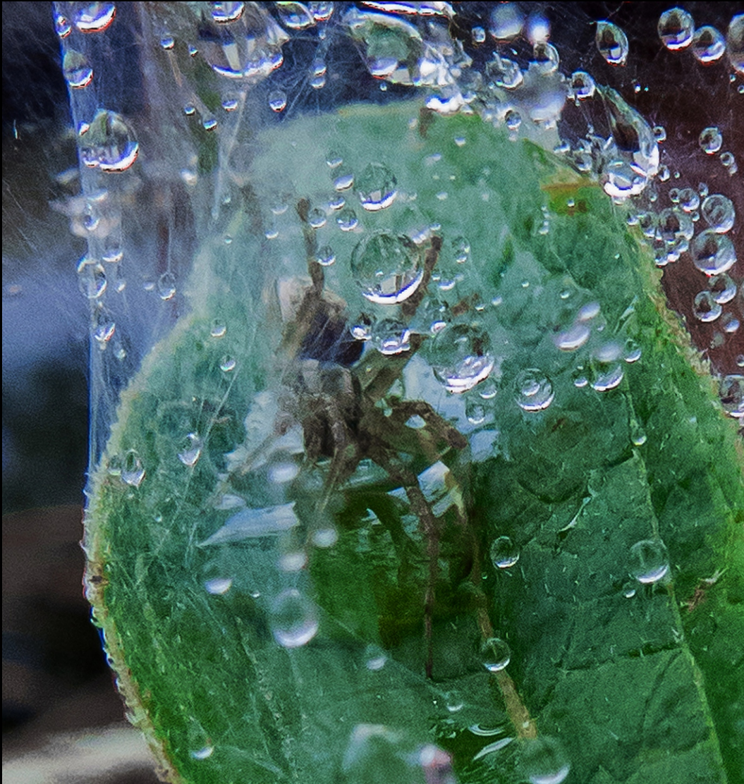
Spider, unidentified, camouflaged by rain drops resplendent on its web. Neighbourhood garden