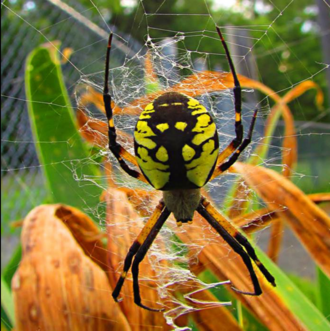
Argiope ( Argiope aurantia ) In a neighbour's garden