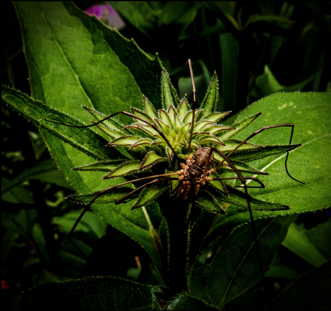
The Daddy Longlegs is not a spider; it is an arthropod. It is included here because, as children, we knew them as spiders because they looked like spiders. So there. Front flower bed.