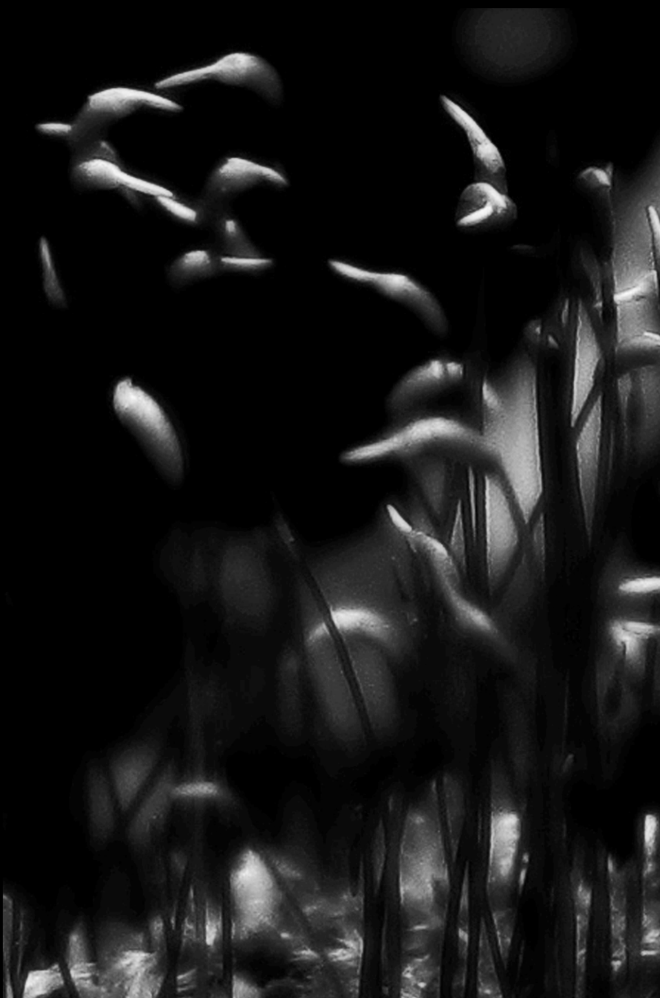
A neighbour's garden