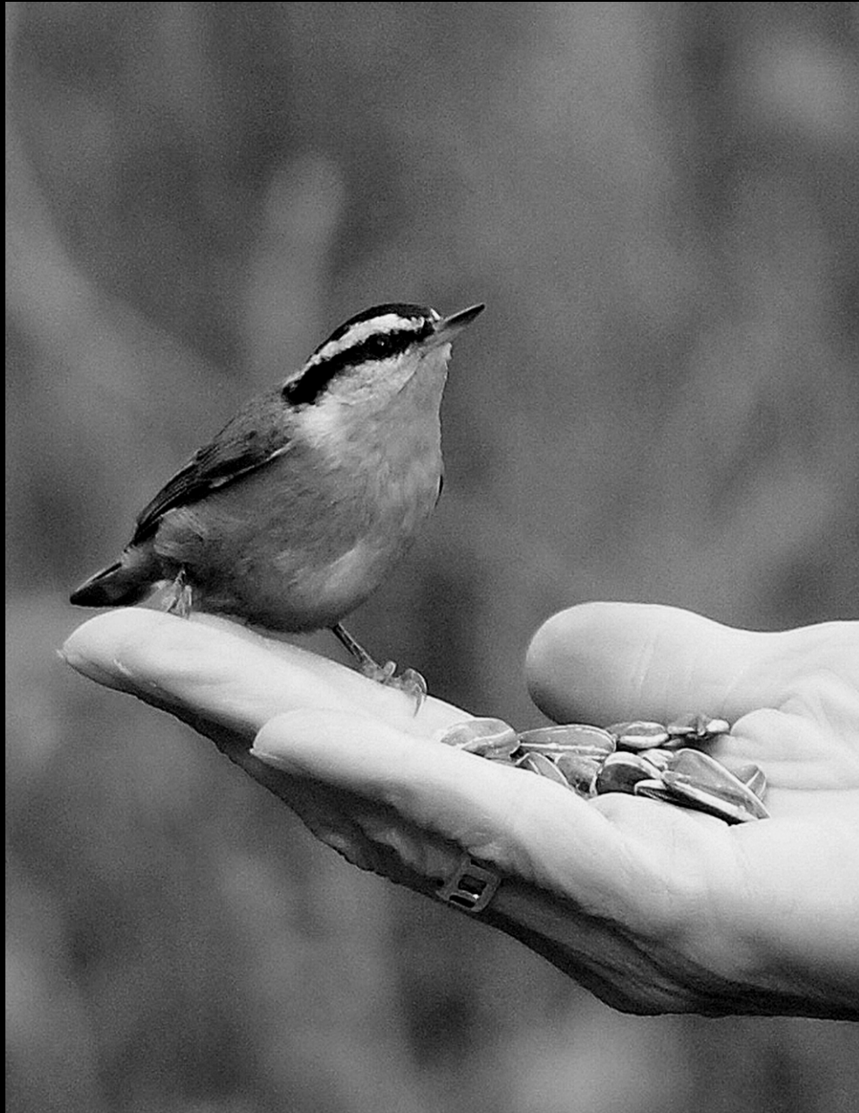
Britannia Meadow, Ottawa