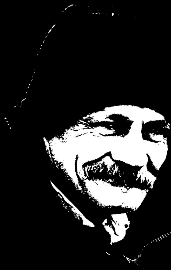
A pleasant fellow, Byward Market, Ottawa, ~1995