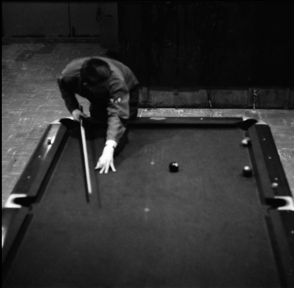
NCO Club, USAF Radar Station, Goose Bay, Labrador, 1961