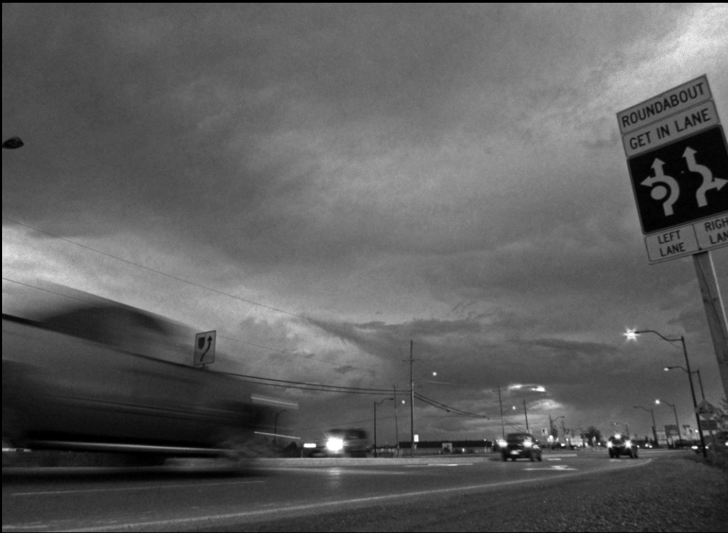
A Roundabout, not in Canada