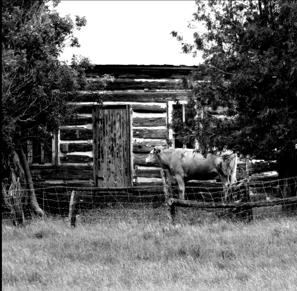
20 minutes west of Ottawa