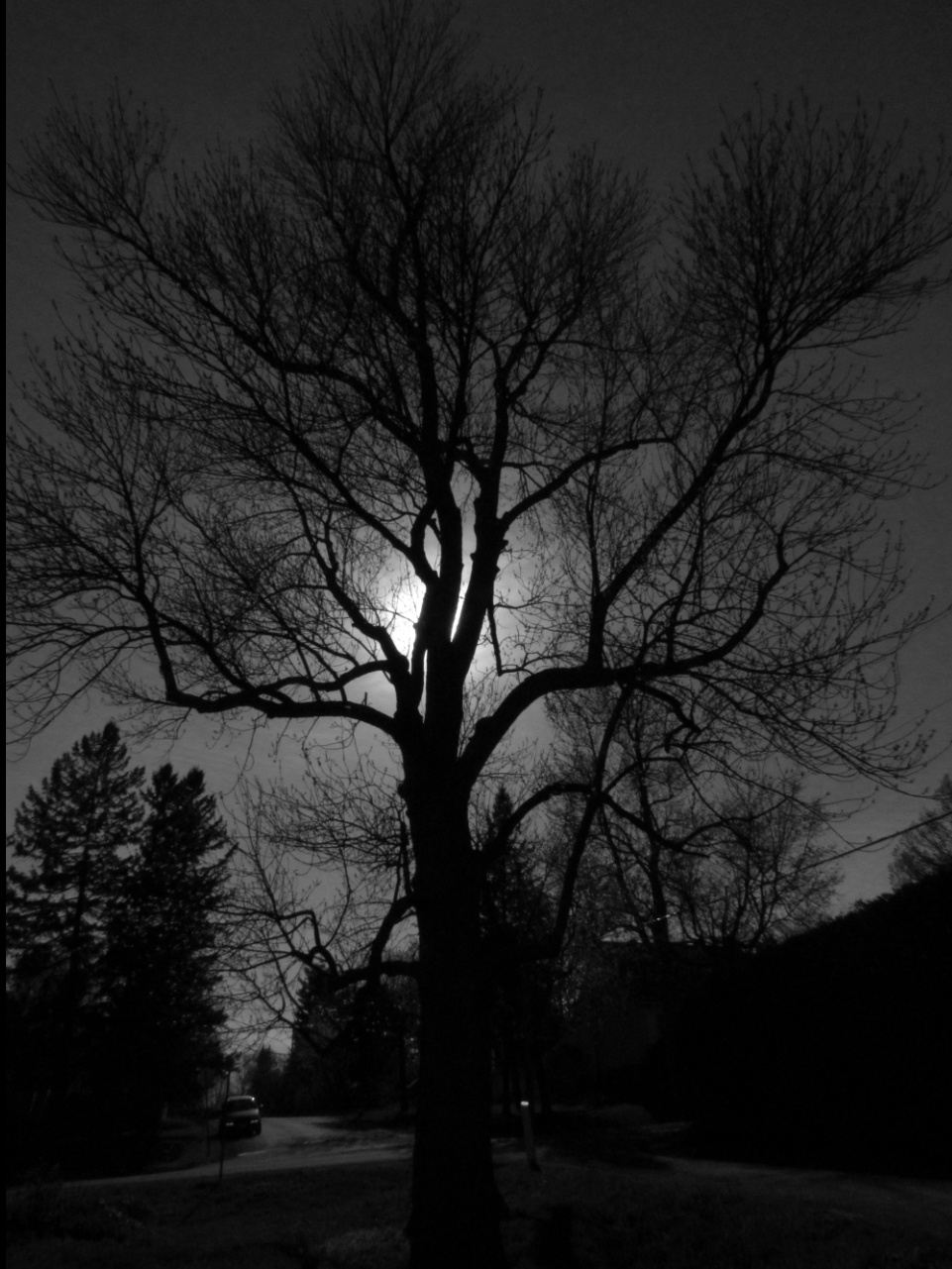
Street Scene, near Ottawa