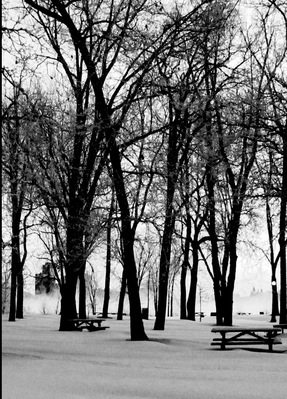
An island in the Ottawa River, Ottawa across the way.