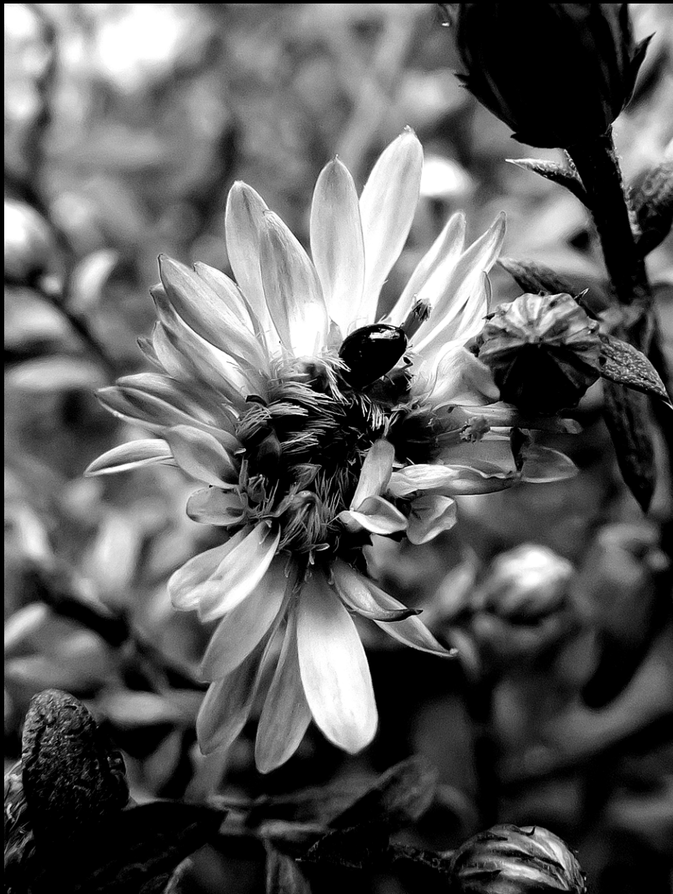
Small black beetle, perhaps a Brachypnoea , dining on a blossom's bounty.