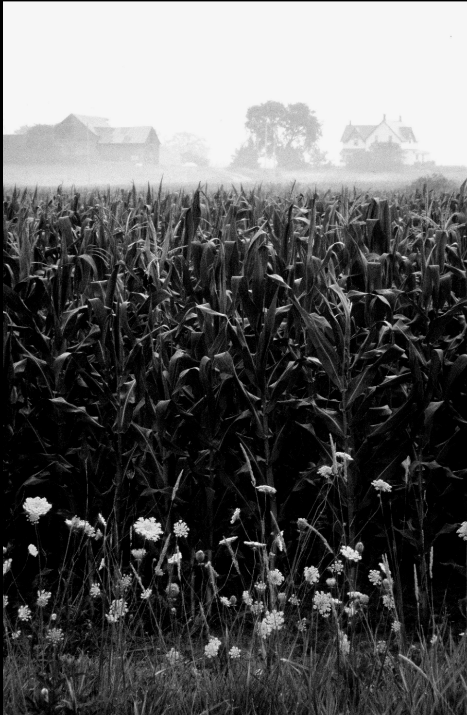
Field of Corn several miles south-west of Ottawa