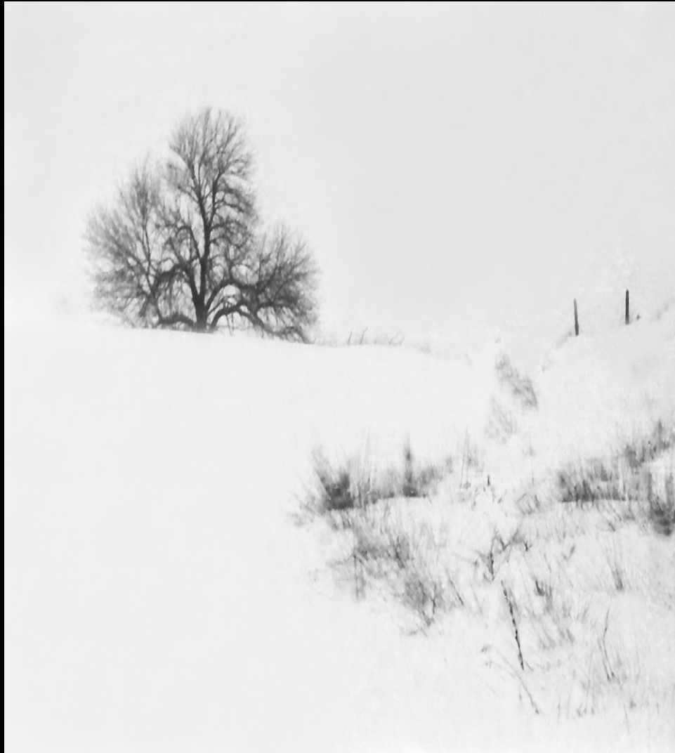
15 minutes south of Ottawa