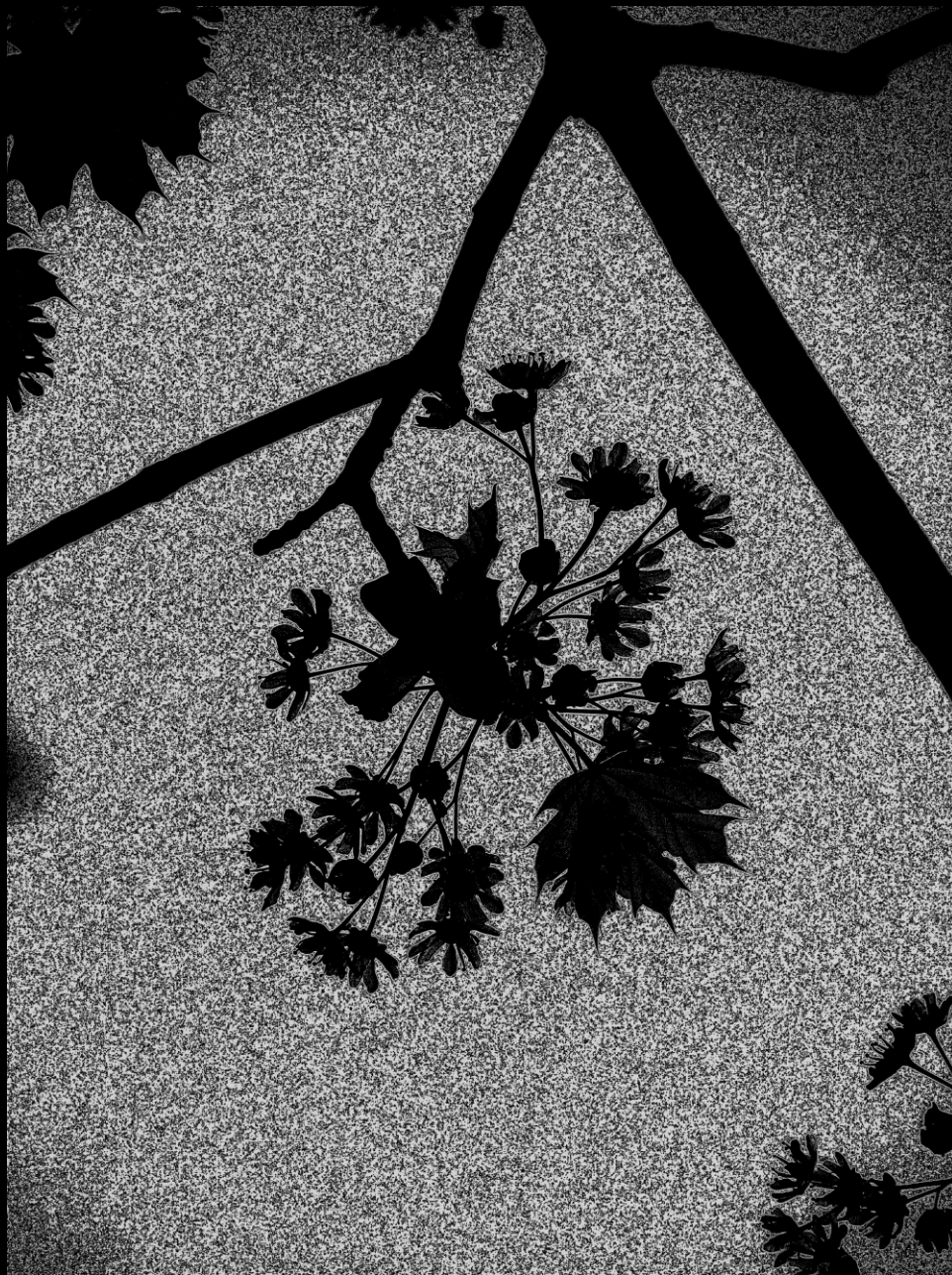
Leaves in Spring against a foggy background.