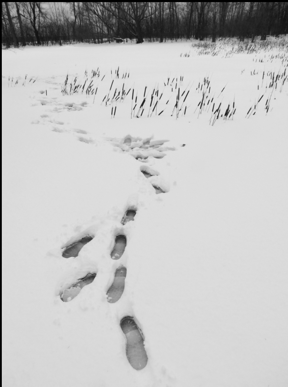
Kilroy might have been here.