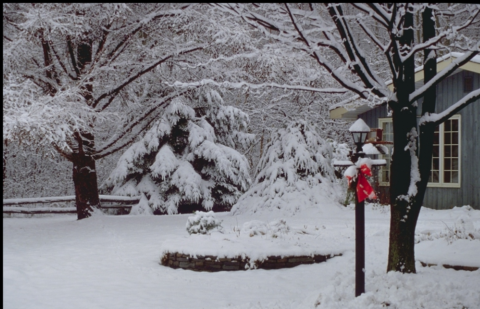
A neighbour's home, Nepean, ON