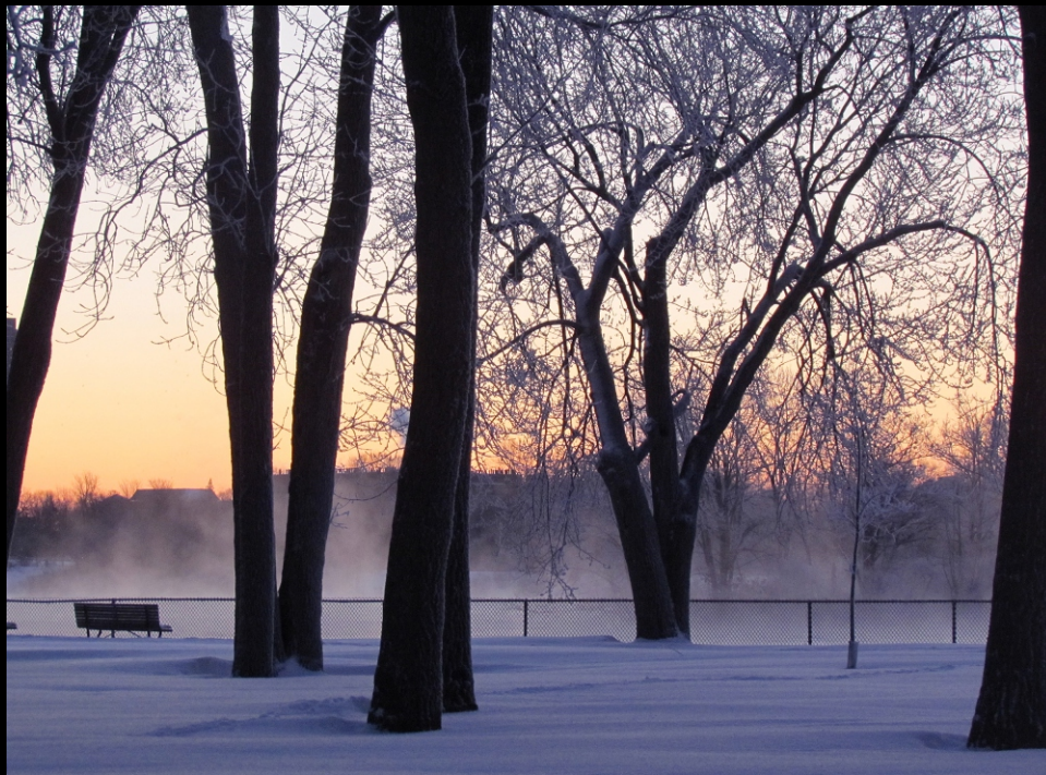
Bate island, Ottawa River