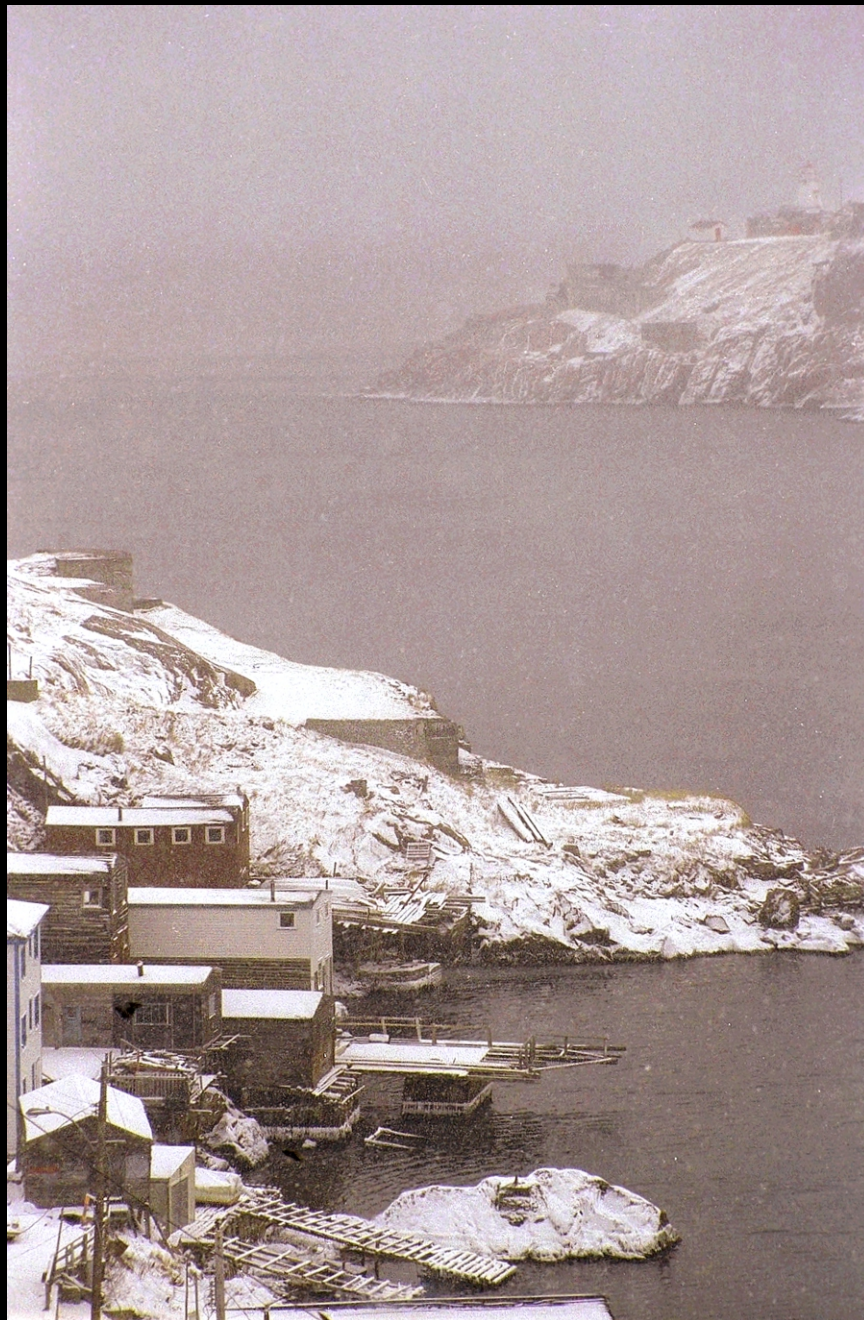
Entrance to St. John's Harbour The Atlantic Ocean and the remnants of WWII artillery defences are just visible through the mists. 1965