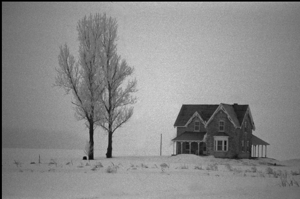
Another abandoned farm - a bit south of Ottawa