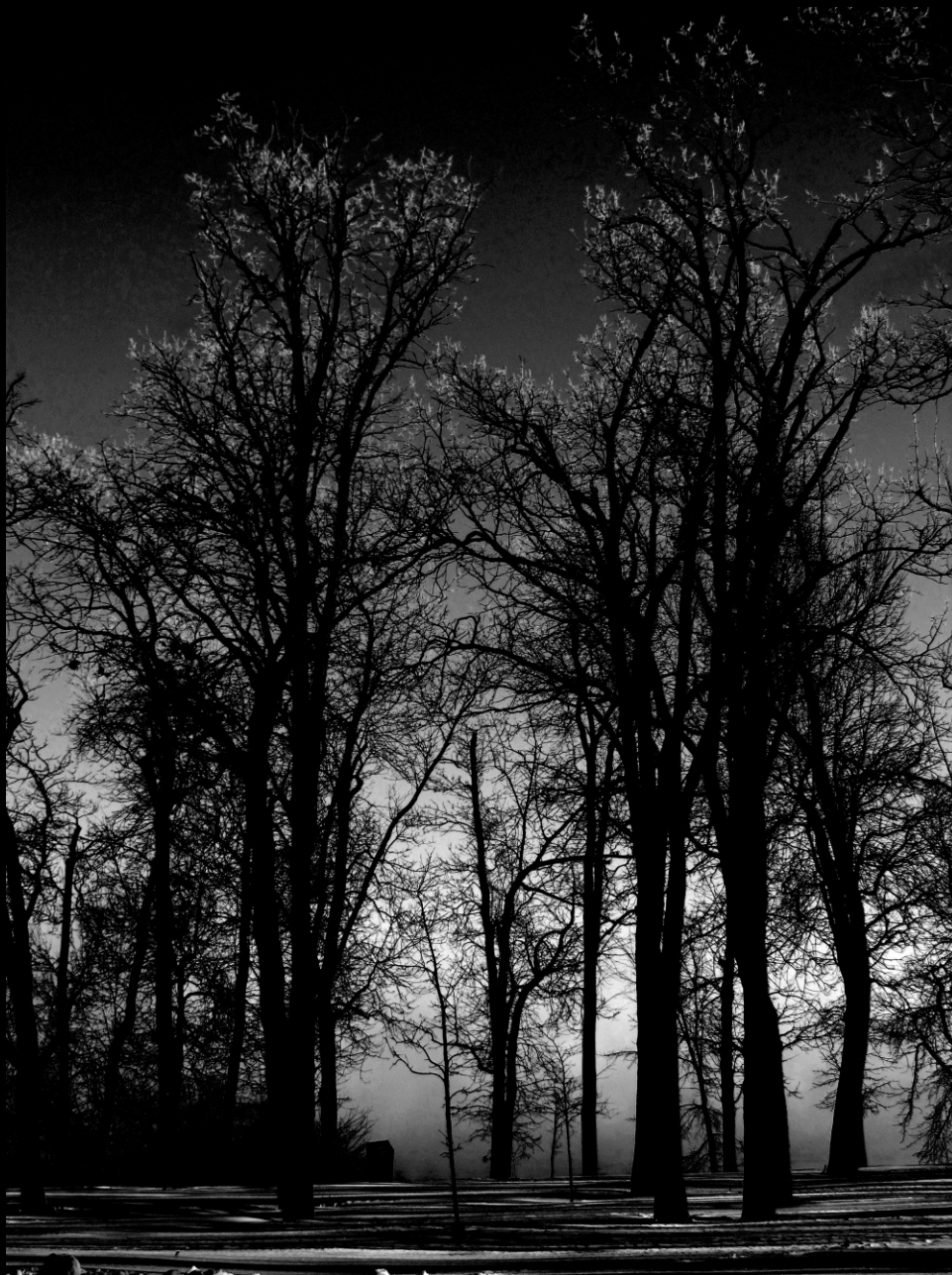
Bate Island, Ottawa River