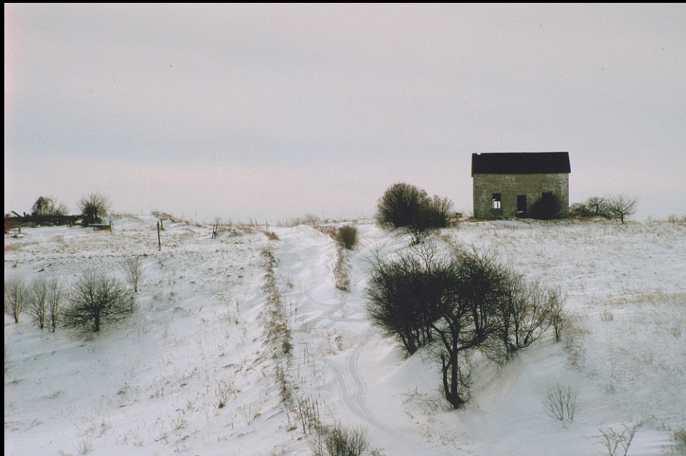
Eagan farm, 4th Concession, NE of Toronto