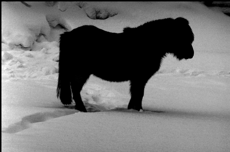
Near North Gower, Ontario