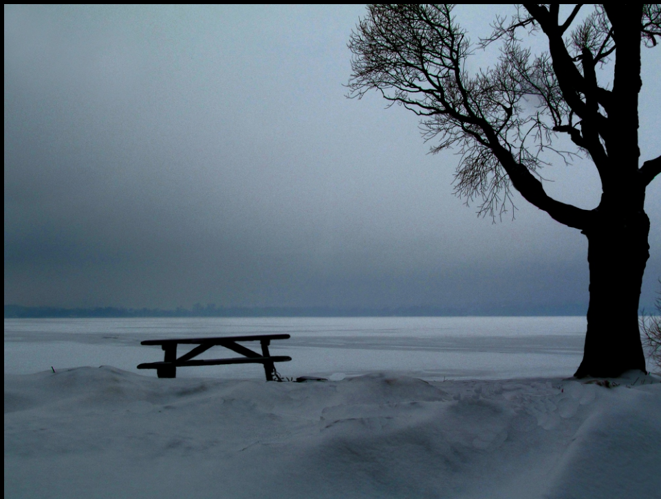
Ottawa River Quebec across the way