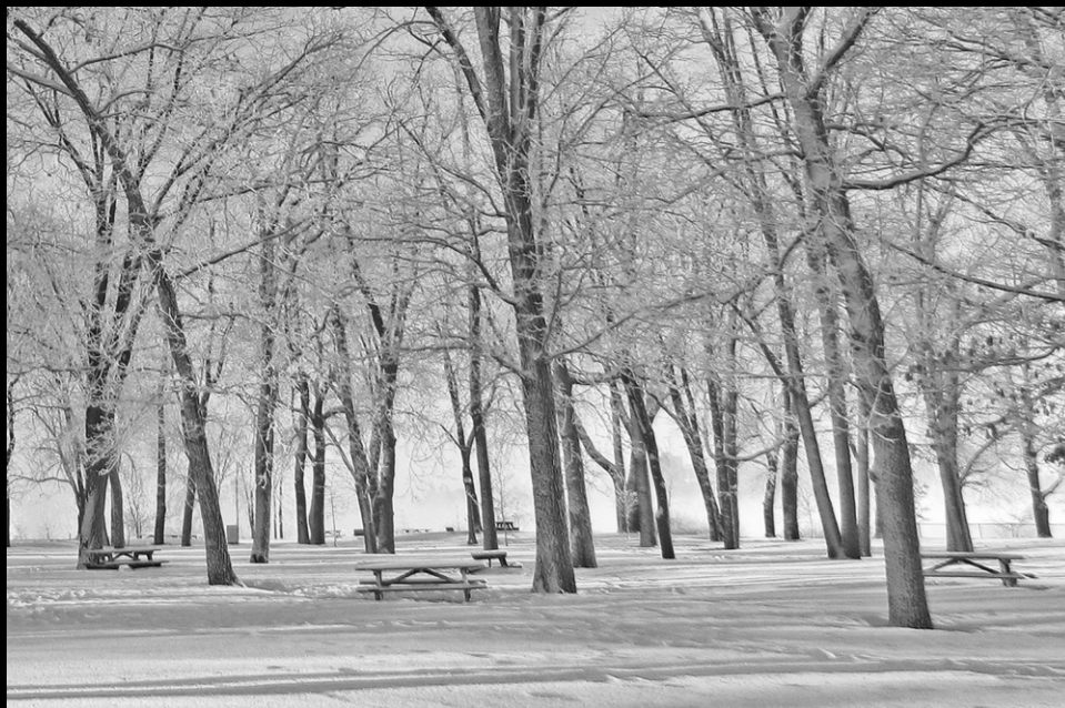
Bate island, Ottawa River